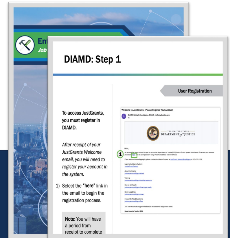
Job Aid Reference Guides