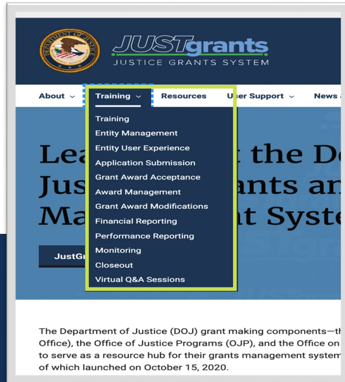
Organized by Topics