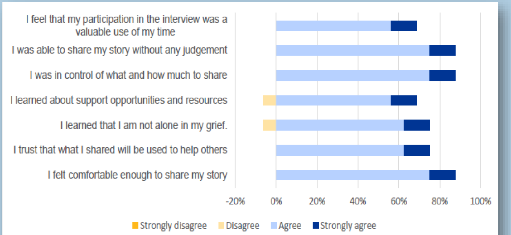
FIGURE 3. PERCENT AGREEMENT FOR INTERVIEW CONTENT (N = 14)